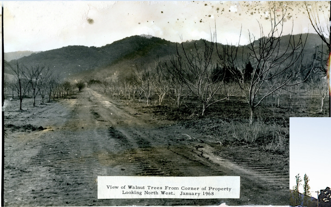
View of Walnut Trees From Corner of Property Looking North West. January 1968.